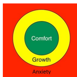
Figure 1: The growth zone model

Drawing upon Dweck's notion of growth mindset [5], we have found it helpful for learners and coaches to think of mathematical resilience as what is needed to stay, safely, as long as possible, in the 'growth zone'. This zone is immediately beyond what a person is able to do reliably, without aid or support. The growth zone model is further expanded in a previous conference paper [6], and the diagram is reproduced here as Fig. 1.